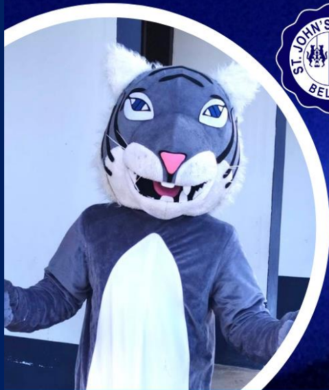
HOME TO THE WILDCATS