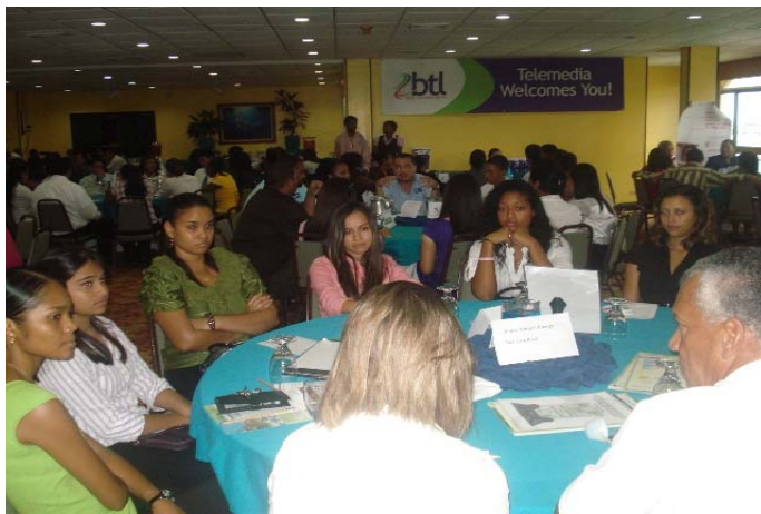
Sponsored by Belize Telemedia Limited

Belize Telemedia Limited was the proud sponsor of the Business Mixer 2010.