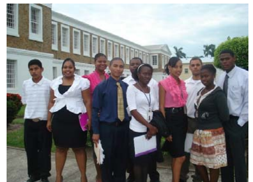
Leadership Academy students at Belize Central Bank