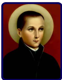
St. John Berchmans Patron Saint of St. John's College

"Love ought to show itself in deed more than words."