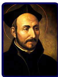
St. Ignatius of Loyola Founder of the Society of Jesus

awarded by junior and community colleges in the United States. This provided graduates of St. John's College Sixth Form a choice of further studies: they could enter Commonwealth Universities which require Cambridge "A Level" certificates or United States Universities as transfer students into the third year of an undergraduate degree program. In 1960, St. John's College Sixth Form was granted membership in the American Association of Community and Junior Colleges.