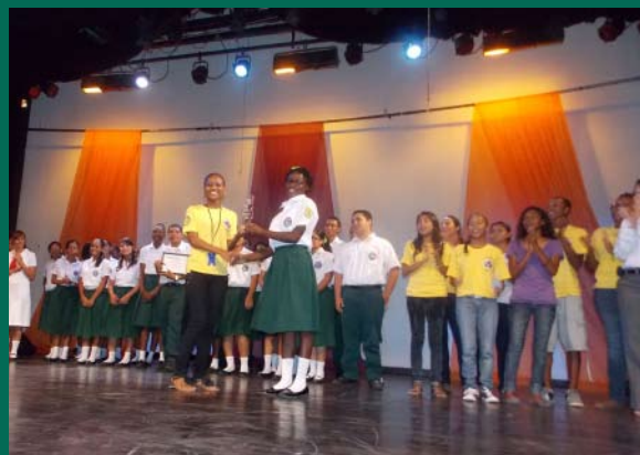
Secondary / Tertiary School Club Award: B.I.O.N.I.C. Believe it or Not I Care 'JC Peer Counseling Group', Earning 1st Place